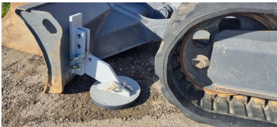
zB Takeuchi TB290